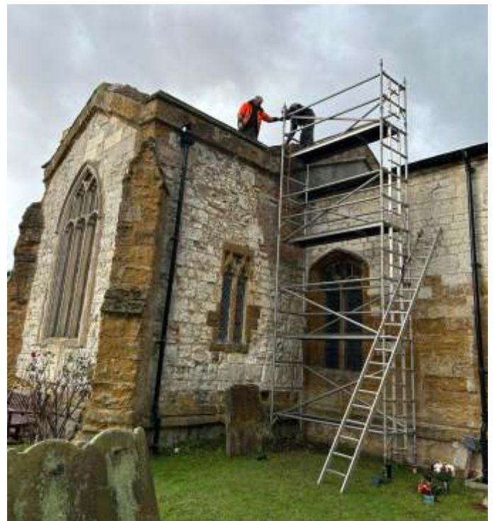
Fixing the church roof

This year, the DCC will be discussing further repair and