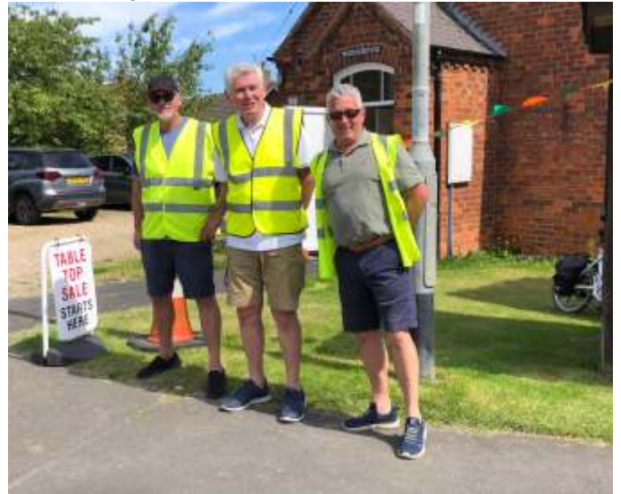
In safe hands at the Table Top Sale!

continue to support events at the village church as well as hosting a number of events specifically to entertaining families.