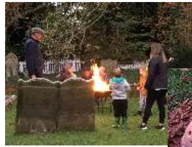
The Pumpkin Trail