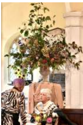
The Flower Festival