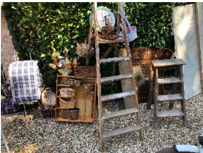
The Table Top Sale

We had a meeting early in the New Year and are now revived and raring to go again and we have a terrific year ahead with a programme of activities for all ages. We will