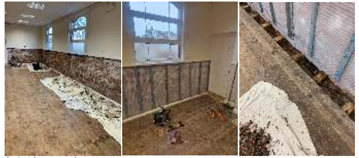
Interior work progresses