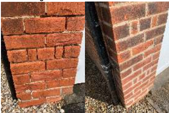
New pointing before and after