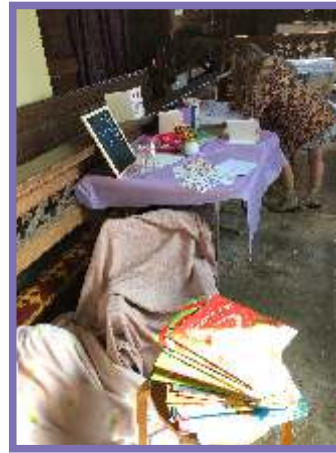
Children's art table

Also in June you will receive a flyer explaining how to take part in the Garden Gate Table Top Sale to be held on 21st July.