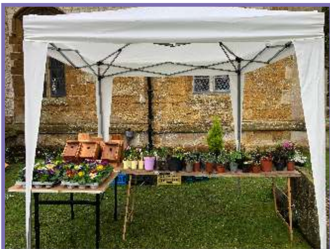
Plants for sale at the Primrose day