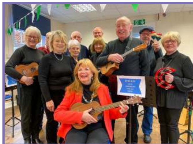
Mayor of Louth with the Ukulele Group