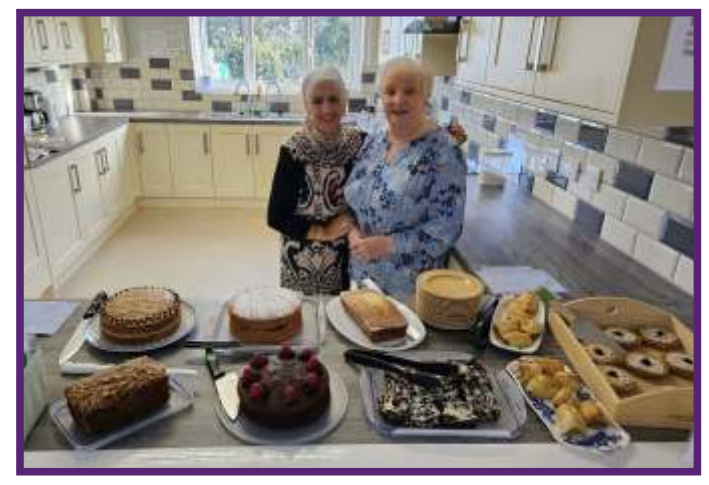
All hands on deck for serving the refreshments!