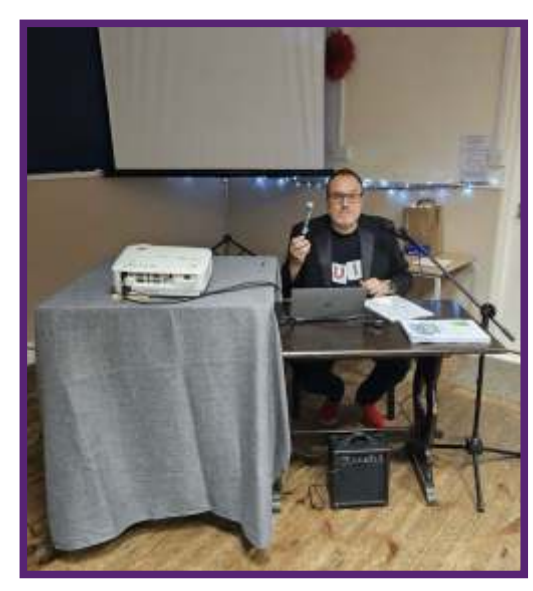
Christmas Quiz Night