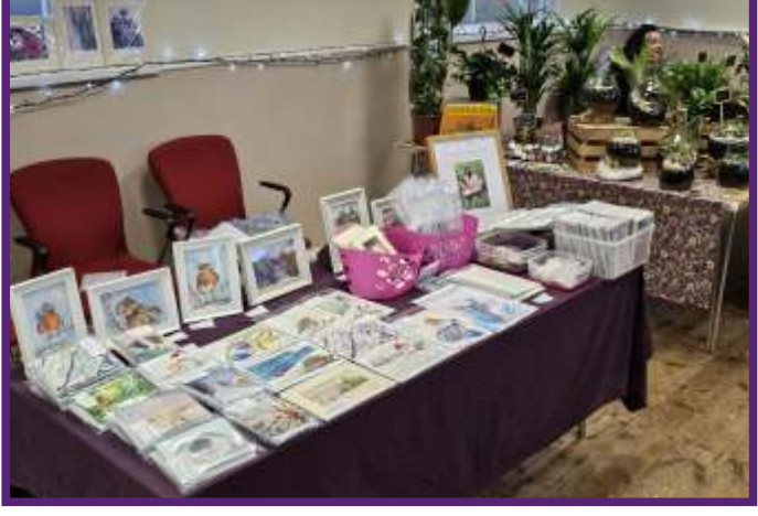
Christmas coffee morning stalls

player for the Hall. A new, double sided, hanging sign, with the Hall name and phone number, was also purchased, for the post on Main Road. Additionally this event paid for the Hall Christmas decorations.