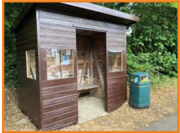
One of the refurbished bus shelters along the Main Road

The Council considers all planning applications objectively and with regards to the village as a whole - it has been supportive of residents inconvenienced by building traffic and will continue to report to Planning Enforcement when conditions stipulated by planning applications are ignored or planning permission is not applied for to begin with.