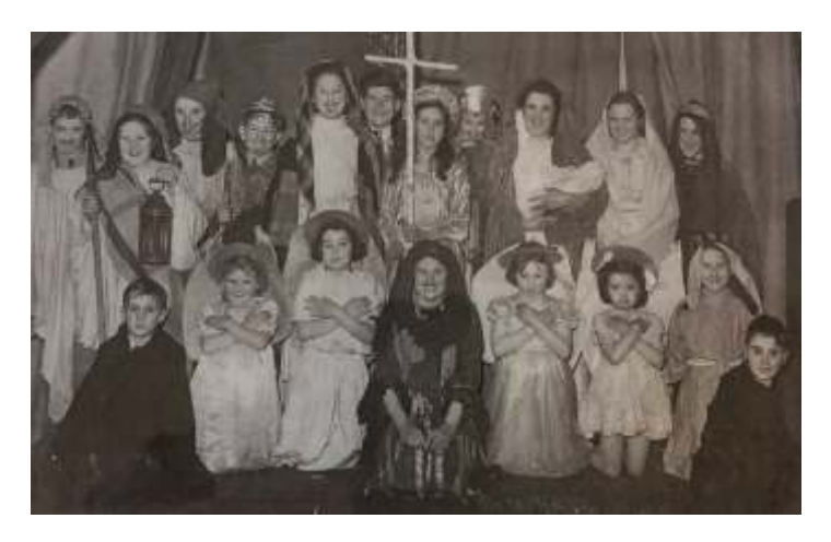
Nativity play thought to be 1950s