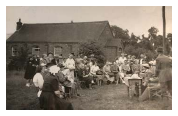
A gathering on the Village Green in 1948, possibly a meeting of Utterby Women's Institute.