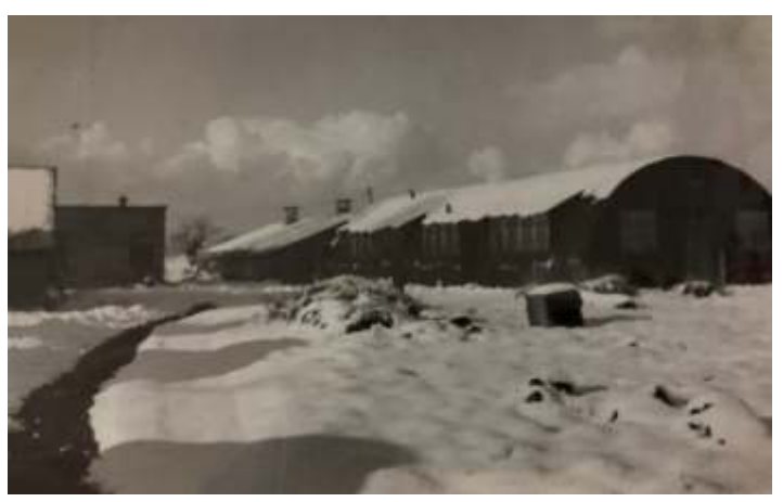
Snowy weather at the poultry sheds on Church Lane, present day site of Chesnut House and Grantham House.