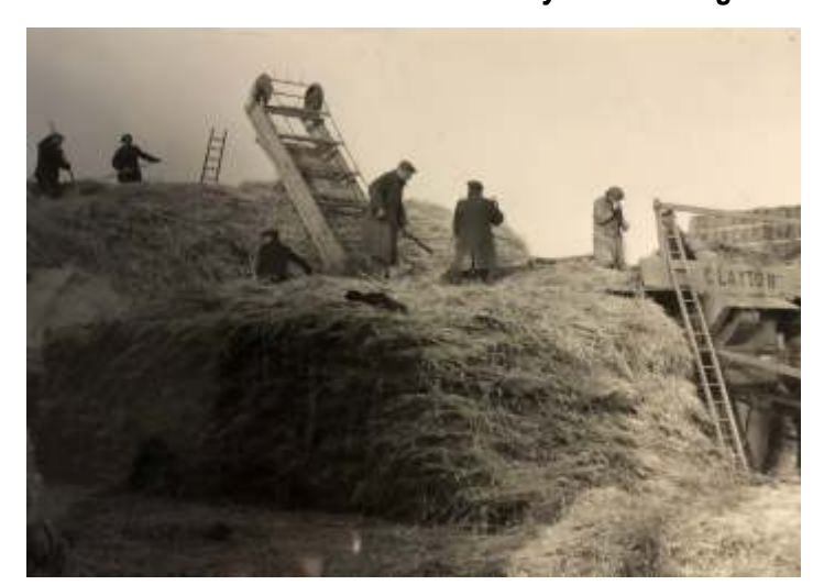
The originals of these photos can be seen hanging in the Village hall. Thank you for letting us use them in the Utterby Voice.