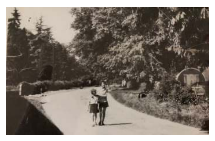
Walking along Church Lane toward the A16

The Village Hall has an excellent display of old photographs of Utterby which they have kindly allowed us to include in the Utterby Voice.