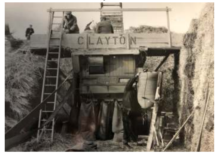
Three of these photographs show the farming community in Utterby early in the 20th century. The fourth photo shows a very different way of arriving at St Andrew's Church for a funeral... by horse and cart.