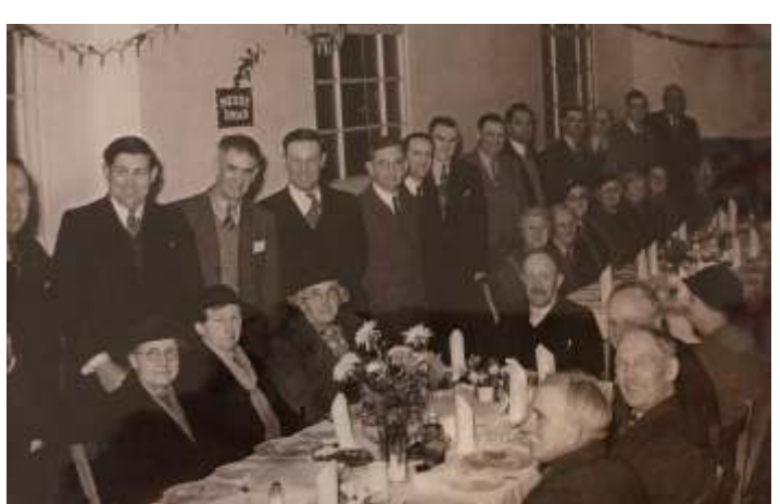
Christmas Party at the Village Hall, thought to be 1960.