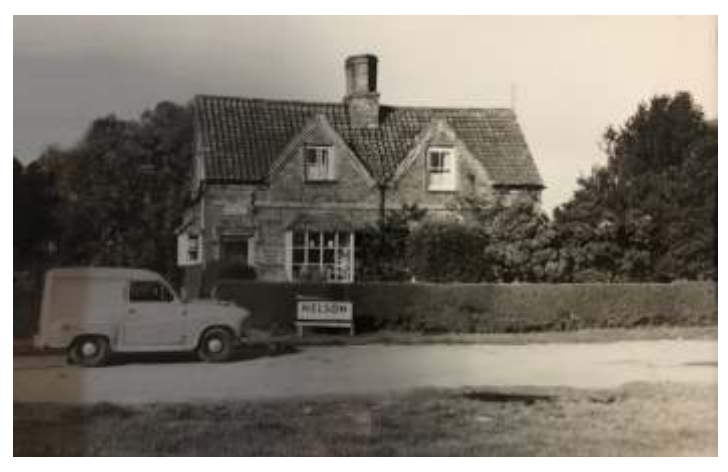
Midlane House on Grange Lane (then the village shop) in the 50s or early 60s. It looks like an Austin 35 van parked outside.