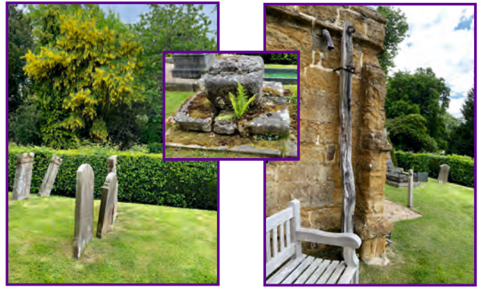
Above: Lovely laburnam and the ancient flagpole. Inset: Ancient cross base

The maintenance and upkeep of the church and churchyard is a constant challenge to the church committee. Like everyone else we are not immune to