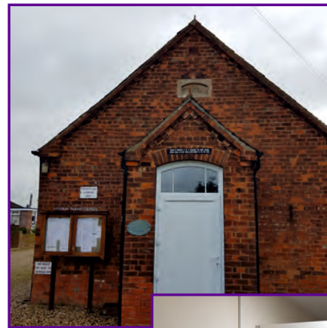
New exterior front door