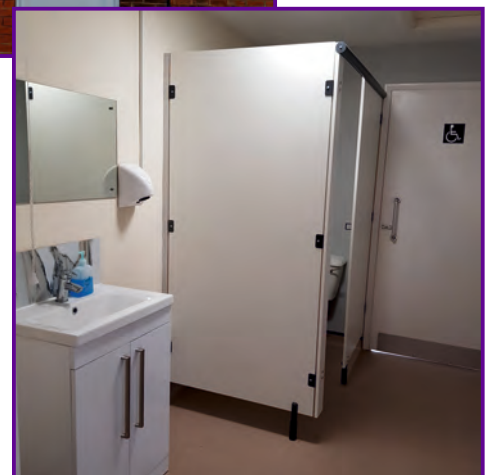
Toilets are now refurbished

PLEASE SUPPORT YOUR VILLAGE HALL For bookings and enquiries call Mob: 07394 957 227