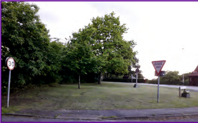
Grass area around Village Sign - An example of the quality grass cutting that keeps our village looking neat and tidy for most of the year.

The Parish Council reports on issues regarding the highways / street lighting and the traffic refuge in the village often using 'Fix My Street' and we continue to make Lincolnshire County Council aware of the speed and volume of traffic on the A16; we will keep doing this as it is one of the major issues in the village.