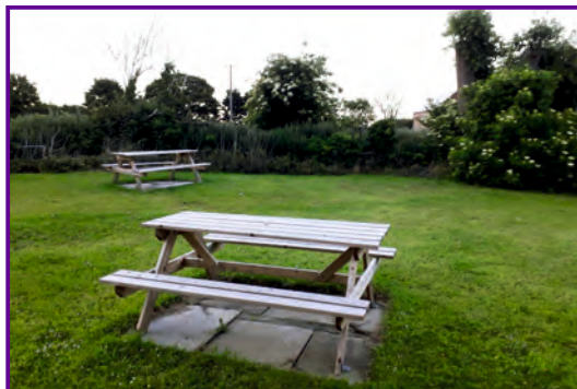
New picnic tables at rear of the hall

Ann Van Spall Treasurer, Utterby Village Hall