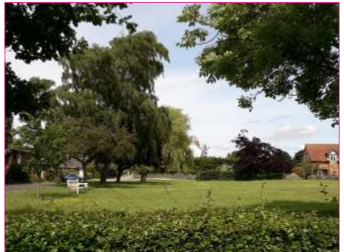
Village Green showing one of the new park benches

The Council considers all planning applications objectively and with regards to the village as a whole - it has been supportive of residents inconvenienced by building traffic and will continue to report to Building Enforcement when conditions stipulated by planning applications are ignored or planning permission is not applied for to begin with.