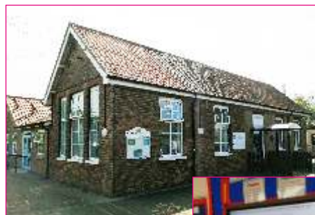
New roof and one of the new interactive whiteboards