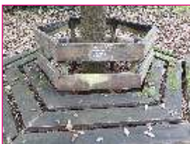
Millennium Bench on Church Lane before and after refurbishment

The Parish Council is a member of the Lincolnshire Association of Local Councils, benefiting from their training programme and legal advice access. It continues to ensure that its framework of policies is regularly reviewed and updated. Key documents include the Code of Conduct, Standing Orders, Financial Regulations and Risk Management/ Strategy. A complete list of the policies and documents are available on the Council website.