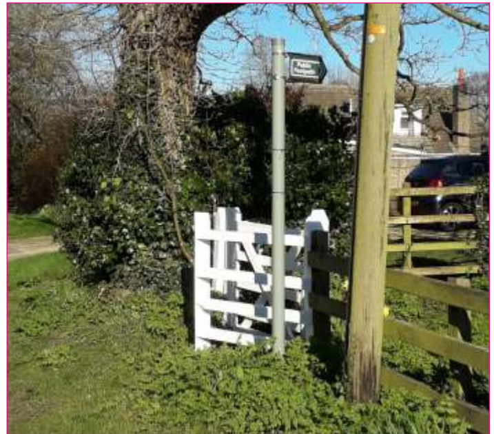
Kissing Gate on Church Lane following refurbishment