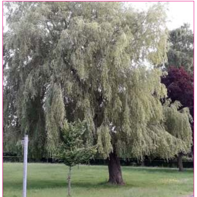
Photos of some of the beautiful trees in the village which includes the Willow tree which is shortly to be felled, but replaced with a new Willow.

I know that many residents will be sad to lose this beautiful tree. The Parish Council has resolved that a young willow tree will be planted on the Village Green in a suitable position so that in a few years time there will again be a splendid willow tree for us all to enjoy. Finally in the near future two new white beam trees will be located on the Village Green to replace trees lost in recent years.