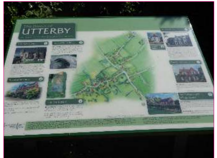
Above: Village info board Below: Packhorse Bridge

NB. Most of this information above is taken from the The Lincolnshire Village Book, written by members of Lincolnshire Federation of Women's Institutes and published by Countryside Books.