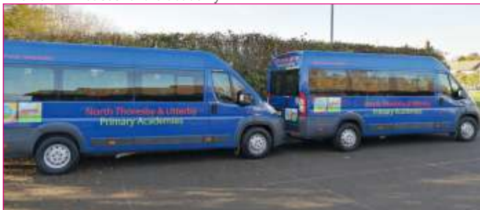
Two new minibuses for the academy

Admissions and Cohort – The Pupil Admission Number (PAN) is 10 per year, with a school capacity of 70 overall. We need to aim to get 10 per year to fill up the places. Currently we have 63 on roll, which is due to stay the same in September as we expect another full year group of 10 pupils.