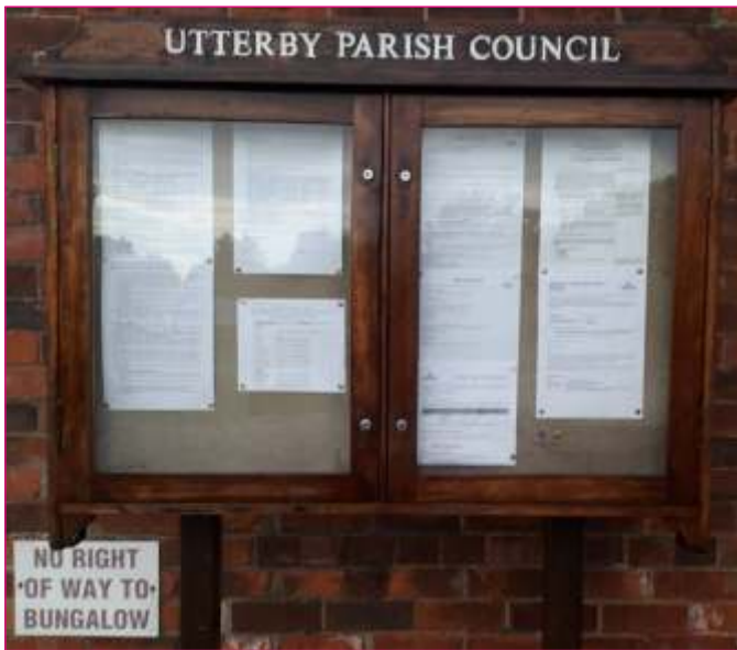
Noticeboard outside the Village Hall following refurbishment

year the Council resolved to make no increase on the Precept for 2021/22 keeping it to £8843.84.