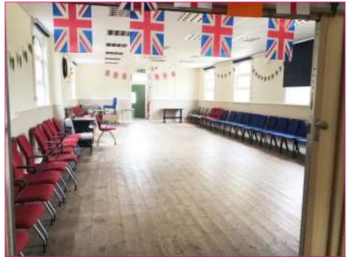
Above: main hall area Below: brand new kitchen