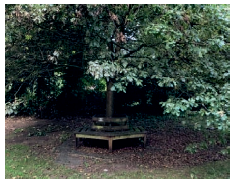
The Millennium oak tree and bench to be refurbished in 2021

repair is an important one since the Council have started to maintain the footpath that links Church Lane to the A16.