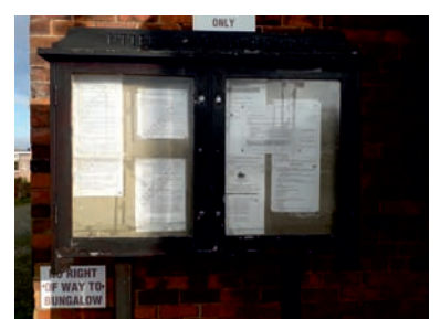
The Kissing Gate on Church Lane and the notice board to be refurbished.